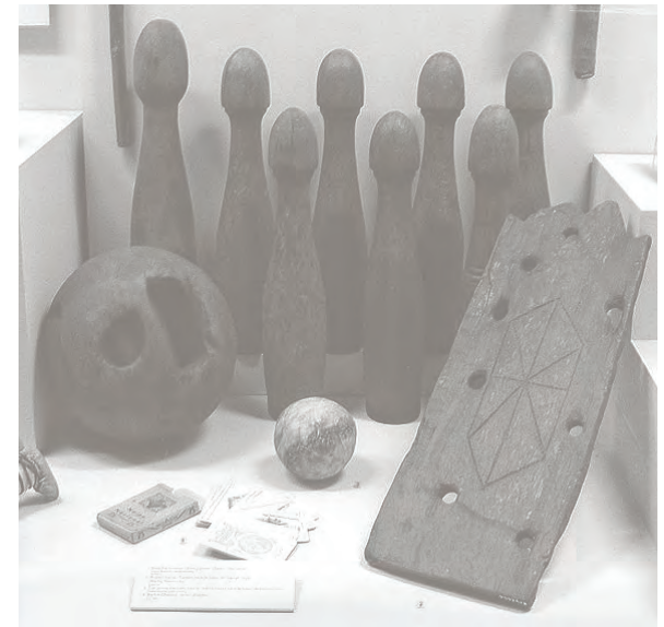
A Basque bowling game.

You belong to the Ice Immigrants, haplogroup K, which emerged around 50,000 years ago and migrated from the Middle East (Near East) to Europe.