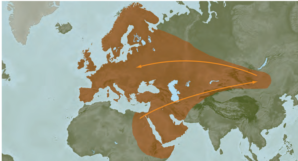
Your maternal ancient ancestors traveled this path—settling for various periods of time at points along the way.

The Ice Immigrants are found at notable rates among populations of Ashkenazi Jews from central